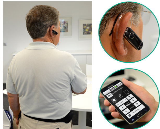
Figure 1: Patient wearing the auditory cueing system.

Patients with PD tend to exhibit shorter step length and, to compensate, increase their step frequency [30]. These symptoms are usually referred to as continuous gait problems , as the changes in the walking pattern are more or less consistent from one step to the next [11]. With disease progression, episodic gait disturbances such as FoG can also appear. FoG is characterized by a sudden loss of movement that occurs while walking or when trying to initiate gait. Festination episodes, characterized by small and rapid steps, can also occur, which frequently leads to falls [10].